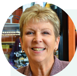
By Jeri Schneebeck, OD Highline Vision Center Aurora, Colorado

It's more convenient for patients if they can make their purchases at one time. I tell them, "You're here now. Sure, we can write down what frames you want, but I can't guarantee that we'll still have them in stock in a few months. If you qualify, special financing options are available. Would you like more information about that?"