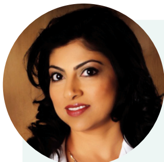
By Leena Adhikari, OD Crystal Vision Optometry Rancho Cucamonga, California